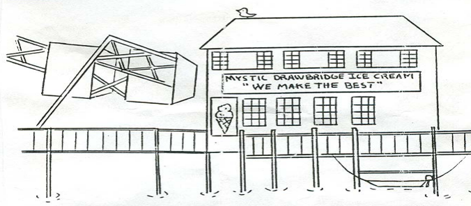
Mystic Drawbridge Ice Cream On the Bridge Historic Downtown Mystic